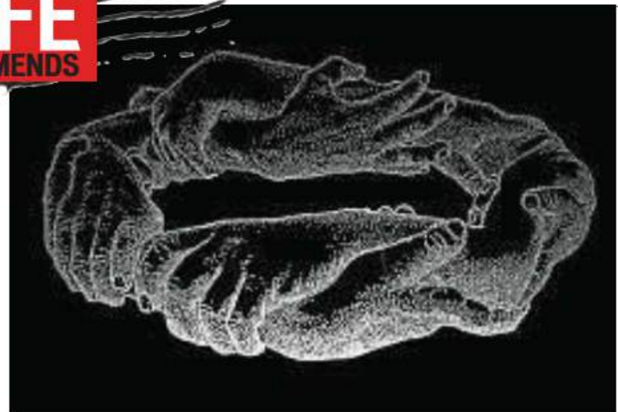
Lifeguard: Perforated plexiglass, chrome paint and LED light