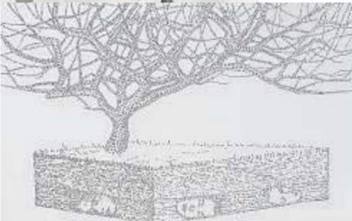
Resurgence: Perforation on paper

The artist has showcased her works across the globe, at the Museum of Modern Art and Guggenheim in New York, USA and in Germany, Austria, Hungary and Italy. Ahead of her show in India, Sard seems excited about discovering the country's heritage. She exclaims, "I always wanted to come to India, and now the visit is even more special with my show. India is so diverse that it is only natural for an artist to be inspired here."